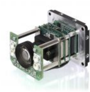
_ mvBlueCOUGAR-X in multi-camera operation in the field of book-binding