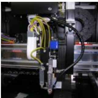
_ Improved preciseness in die-bonding