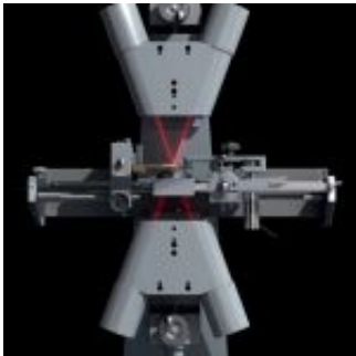
_ Measuring optical lenses