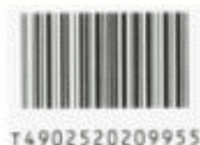
Major barcode types